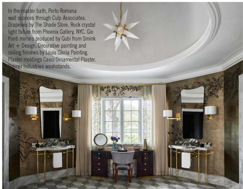
In the master bath, Porto Romana wall sconces through Culp Associates. Draperies by The Shade Store. Rock crystal light fixture from Phoenix Gallery, NYC. Gio Ponti mirrors produced by Gubi from Smink Art + Design. Decorative painting and ceiling finishes by Louis Gloria Painting. Plaster moldings Casci Ornamental Plaster. Palmer Industries washstands.