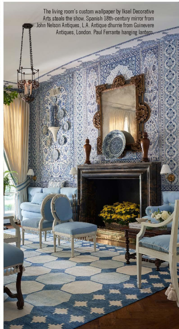
The living room's custom wallpaper by Iksel Decorative Arts steals the show. Spanish 18th-century mirror from John Nelson Antiques, L.A. Antique dhurrie from Guinevere Antiques, London. Paul Ferrante hanging lantern.