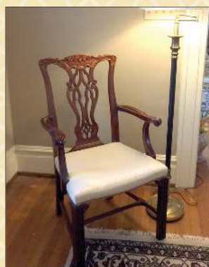
Set of 8 Carved Mahogany Dining Chairs by Hickory Chair