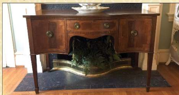
Late 19th Century Georgian Style Mahogany Serpentine Front Sideboard

117 N Main St, Belmont, NC 28012 (704) 825-8809 | Tuesday-Saturday 10am-5pm