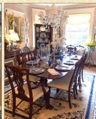
Mahogany Table Featuring Twin Pedestals with Carved Acanthus Leaves