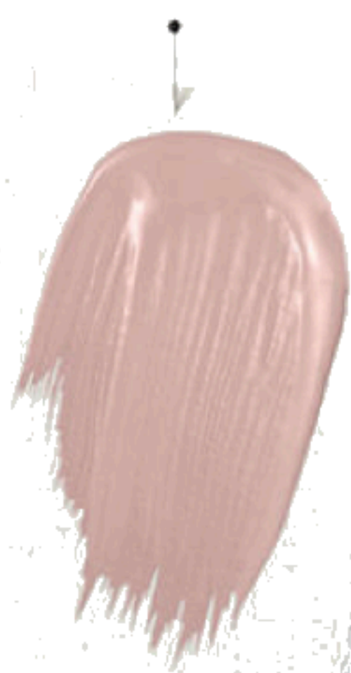
FRUIT SHAKE 2088-60 BENJAMIN MOORE

"My clients were the catalyst for this hue. It's not what I would instinctively gravitate toward in a bathroom, but they requested an uplifting pink for their master suite. The surprise is how flattering it is—the peachy undertones bathe your skin in a warm glow. What could be better in a room where you're naked most of the time?"