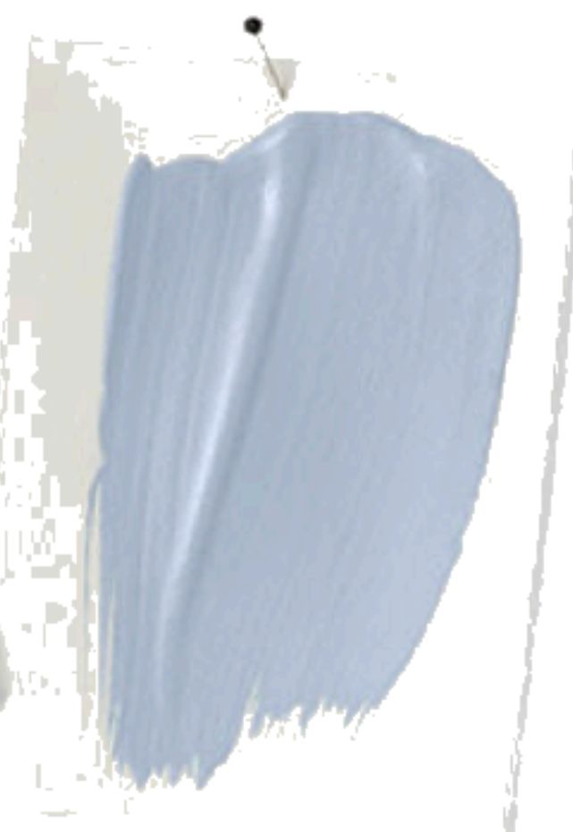
HONEST BLUE SW 6520 SHERWIN-WILLIAMS

"Along with being undersized, lots of bathrooms lack natural light. I counter the dimness with this take on robin's-egg blue, which to me symbolizes rebirth. Its subtle gray notes make it contemporary and give it versatility. Teamed with penny tiles, it can swing retro, and in high gloss, it's nonstop drama."