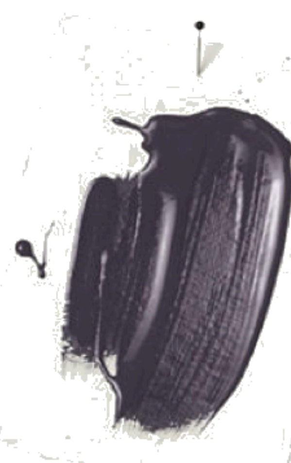
GALAXY 2117-20 BENJAMIN MOORE

"In a powder room with a bold marble basin in bright emerald green, dark lapis, and rich chocolate brown, I did this lush purple everywhere—the walls, the ceiling, the trim, the door. I chose a totally flat matte, and it's like being swaddled in cozy cut velvet. At night, when the light is low, it morphs into the deepest, ripest currant."