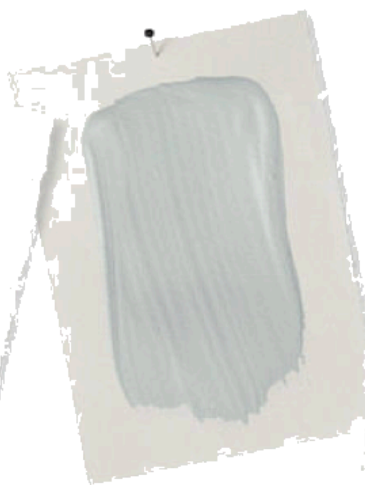
SKYLIGHT 205 FARROW & BALL

"This is the gentle, serene color of the fog that rolls in every evening here in San Francisco. It's not a true gray; it has a blue cast to it that I find very soothing. A classic with staying power, it's great for a vanity, which is how I used it."