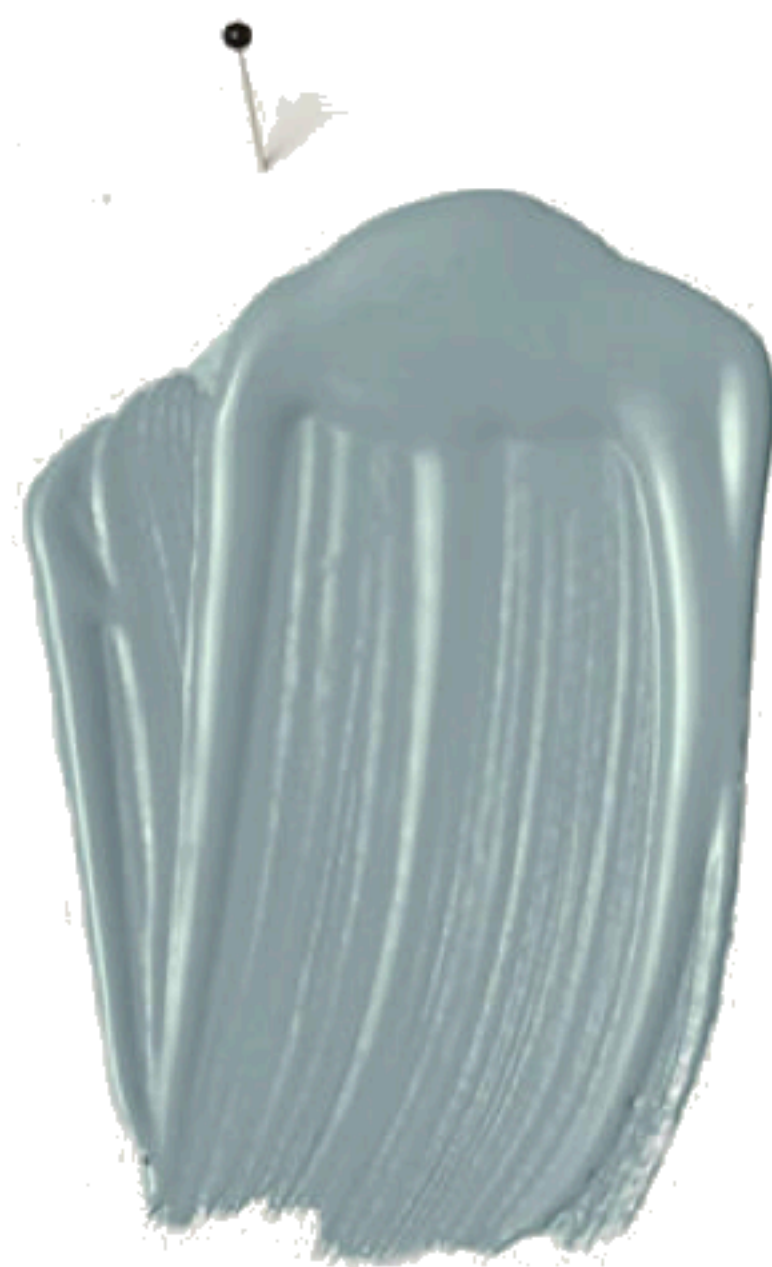
DIX BLUE 82 FARROW & BALL

Don't go with the flow: These gutsy colors will embolden your bath and powder rooms.