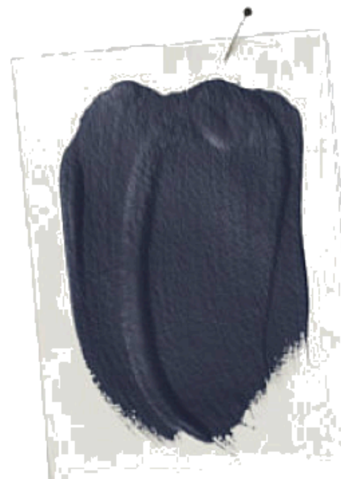
DEEP ROYAL 2061-10 BENJAMIN MOORE

"With this soulful navy, I created a luminescent powder room that's like stepping into Vincent van Gogh's Starry Night . I painted it on the wainscoting and trim in a high-gloss finish, and its shimmer plays off the wallpaper's iridescent blue stripes and the cobalt marble of the vanity. The room is moody and swirling with crazy patterns—but it works!"