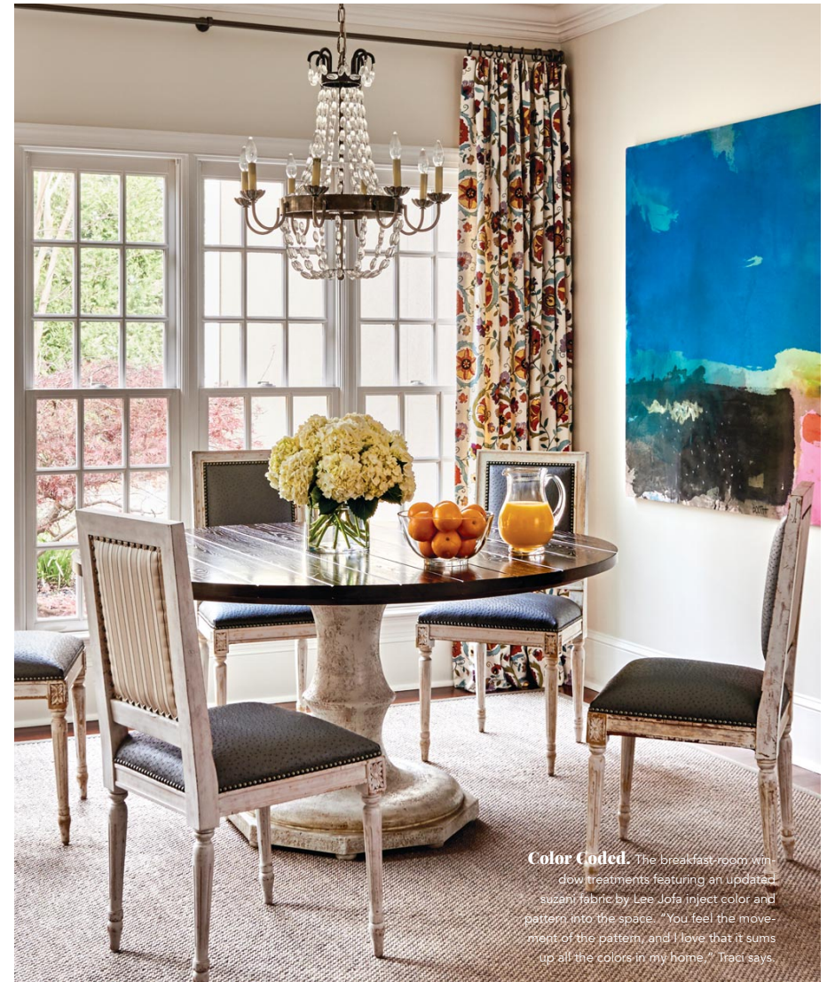
Color Coded. The breakfast room window treatments featuring an updated suzani fabric by Lee Jofa inject color and pattern into the space. "You feel the movement of the pattern, and I love that it sums up all the colors in my home," Traci says.

Charming and classic, Southern homes are timeless in style and alive with sunny colors and playful patterns. A bit on the traditional side, they're a perfect balance of elegant and comfortable.