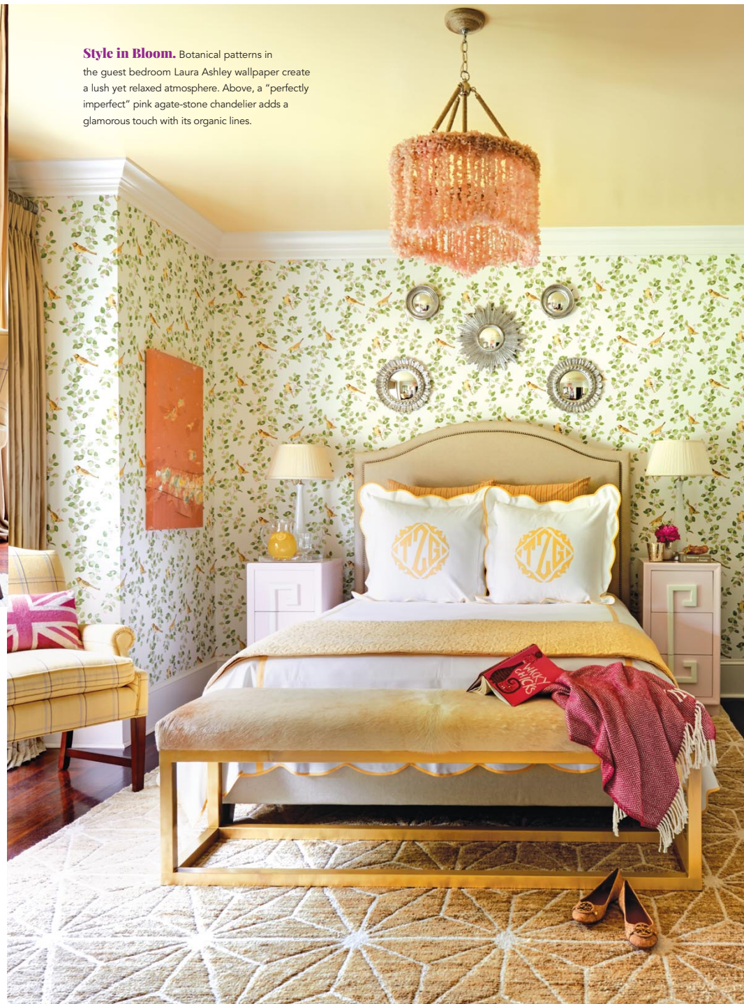
Style in Bloom. Botanical patterns in the guest bedroom Laura Ashley wallpaper create a lush yet relaxed atmosphere. Above, a “perfectly imperfect” pink agate-stone chandelier adds a glamorous touch with its organic lines.