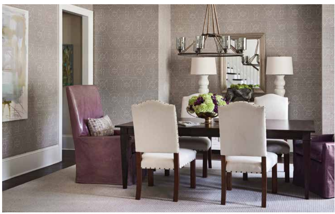
To see all the photos from this home, visit www.urbanhomemagazine.com.